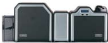
Lamination option and dual-sided printer/encoder